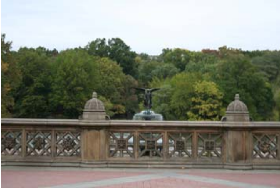
Bethesda Fountain on the 72 nd Street Transverse

We started on 50 th street and 5 th Avenue and headed to 72nd street to turn into the Park, and then we eagerly awaited the runners to come by. We would run across the park via the 72 nd Street Transverse 4 more times before this race was over.