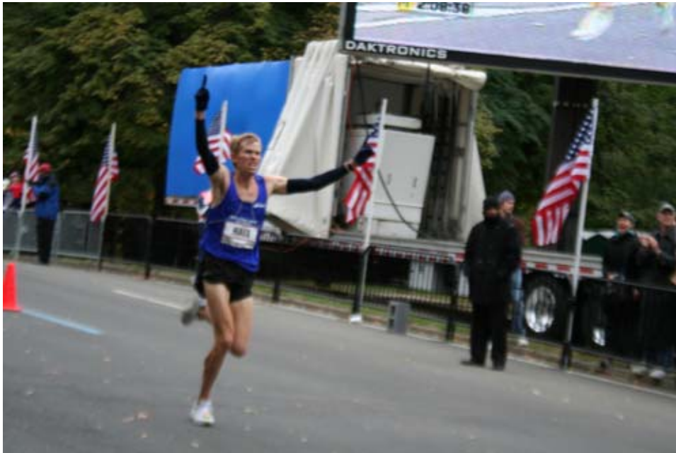
Ryan Hall (Champion) raising his fingers to God as he nears the finish line.

All in All, this race was just a blast. I was thrilled to see Ryan Hall pumping his arms, displaying his emotions all the way down the last 400 meters. What a bold race he ran. That guy is Phenomenal! Seeing him cruise down the finish line, hand slapping and celebrating and urging the crowd to join him in his ecstasy, now that was a sight to behold!